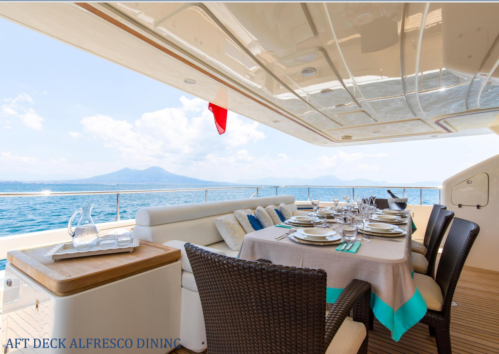
AFT DECK ALFRESCO DINING