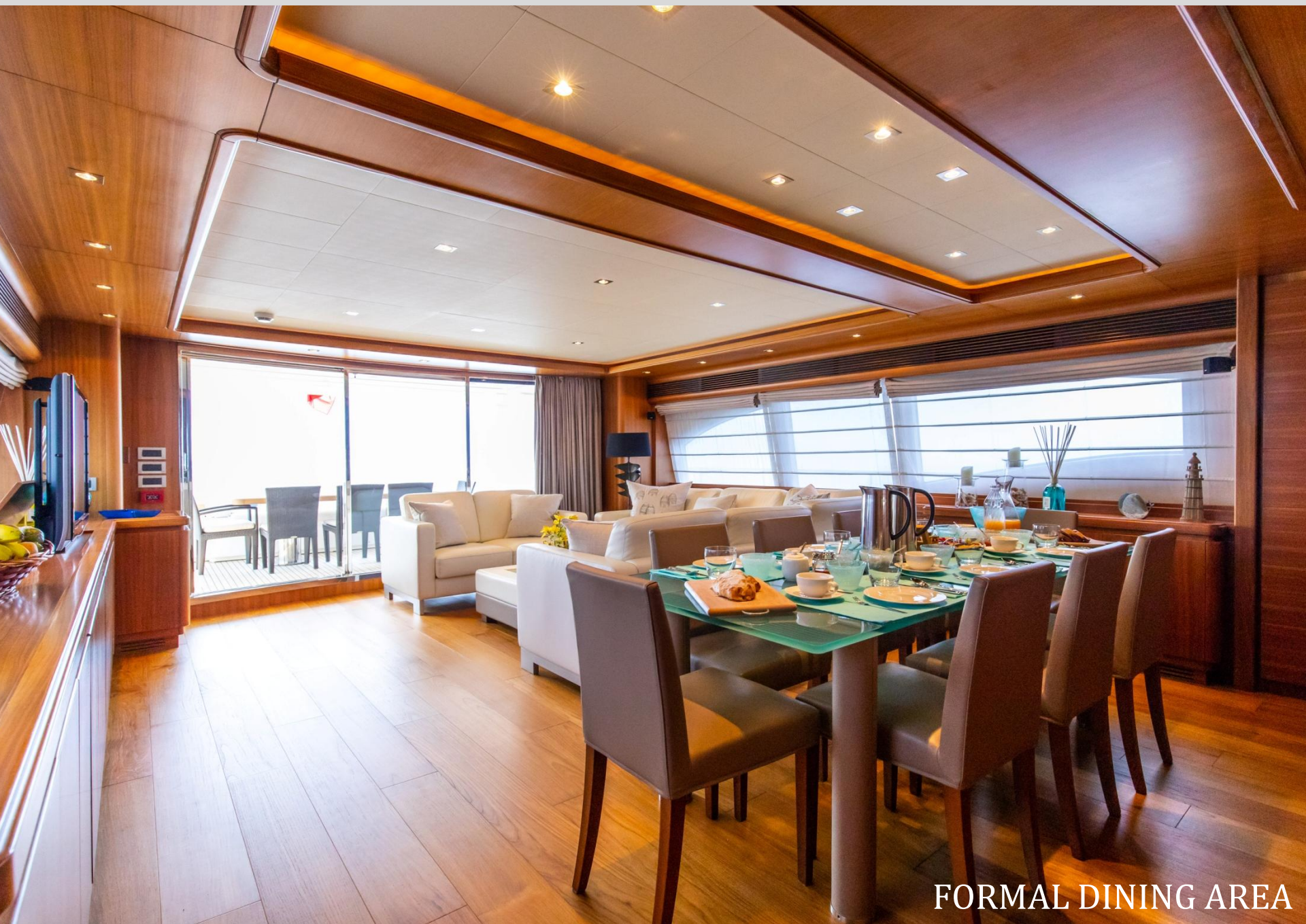
FORMAL DINING AREA