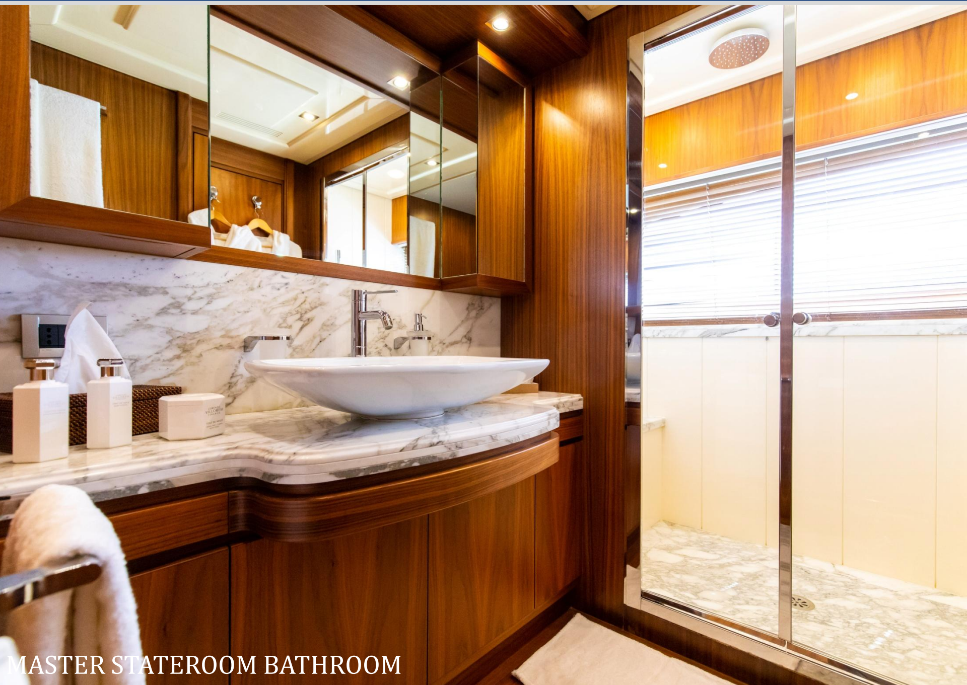
MASTER STATEROOM BATHROOM