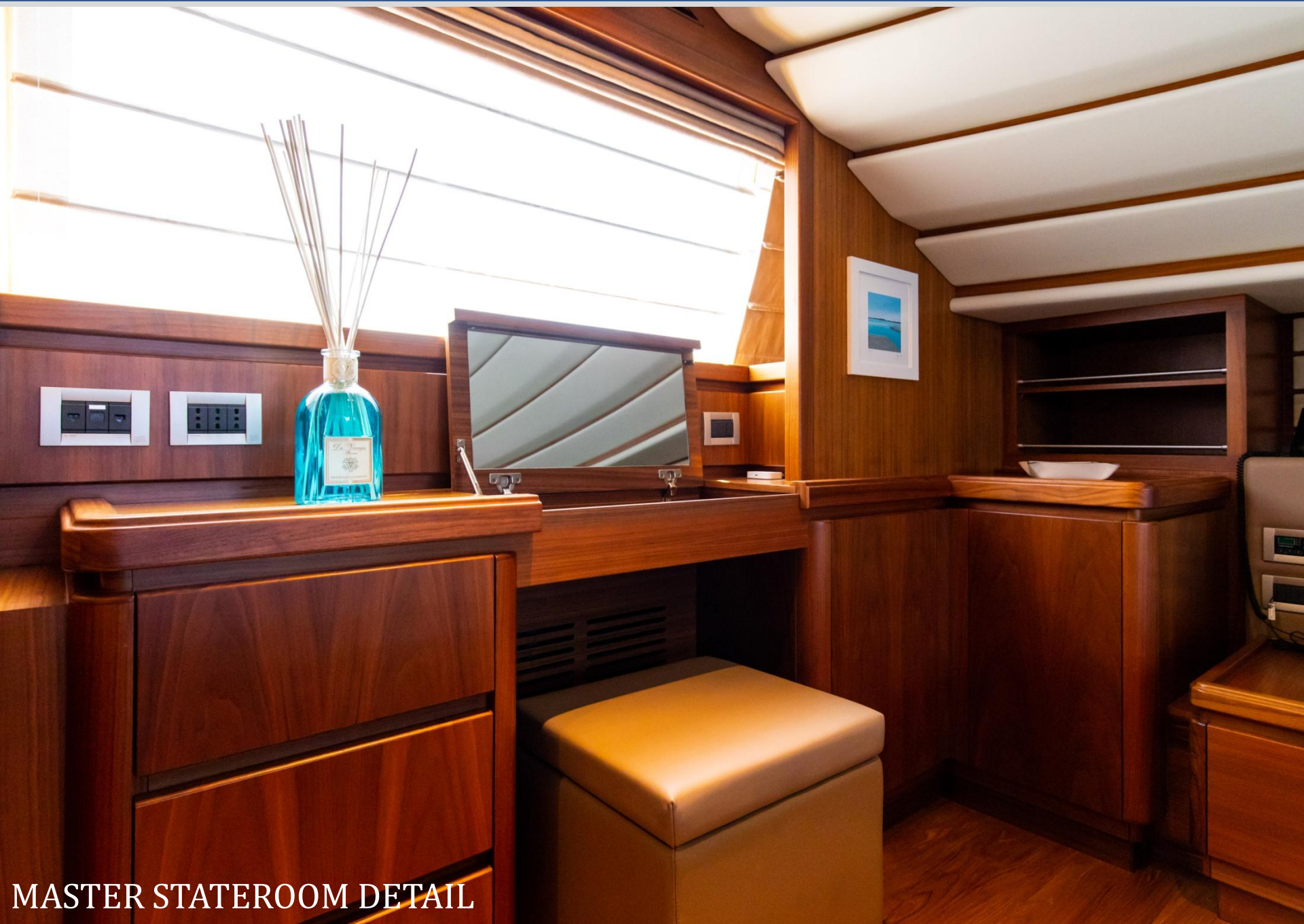
MASTER STATEROOM DETAIL