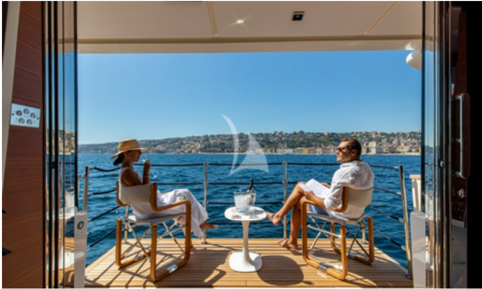
Balcony lounge area