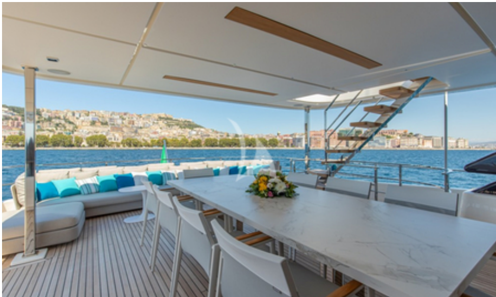
Upper deck al fresco dining area