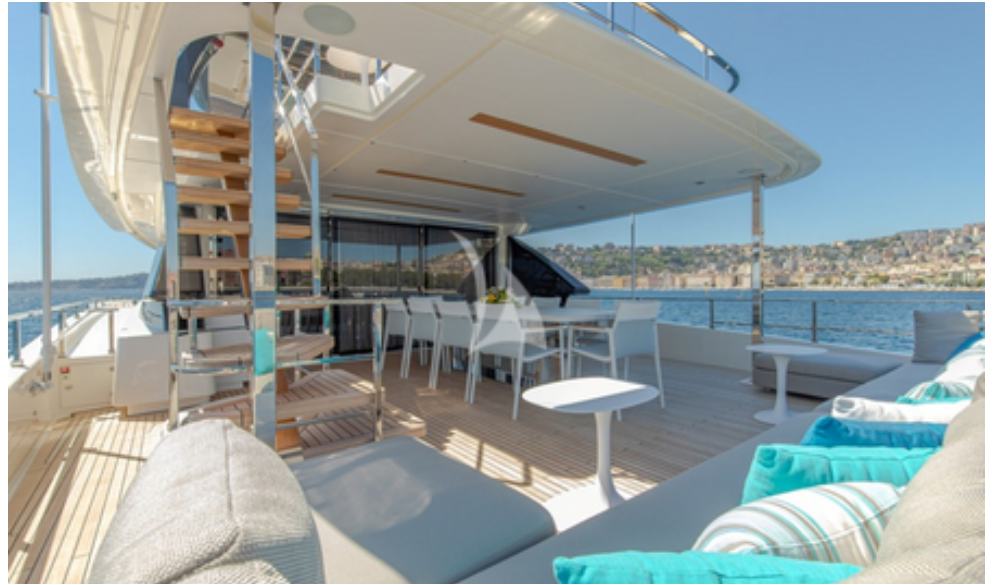
Upper deck full view