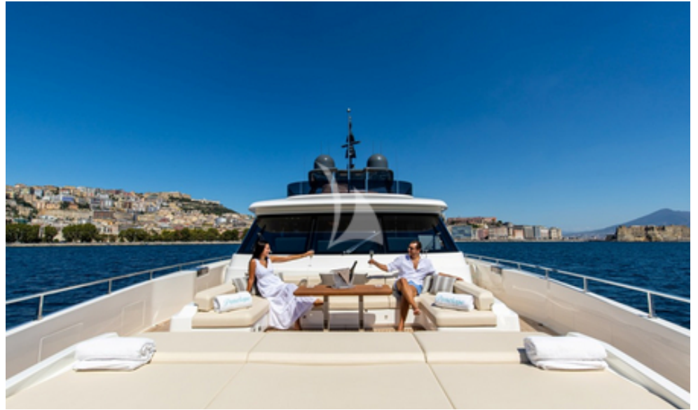
Solarium lounge area