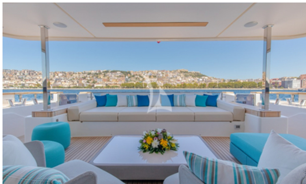
The aft deck lounge area