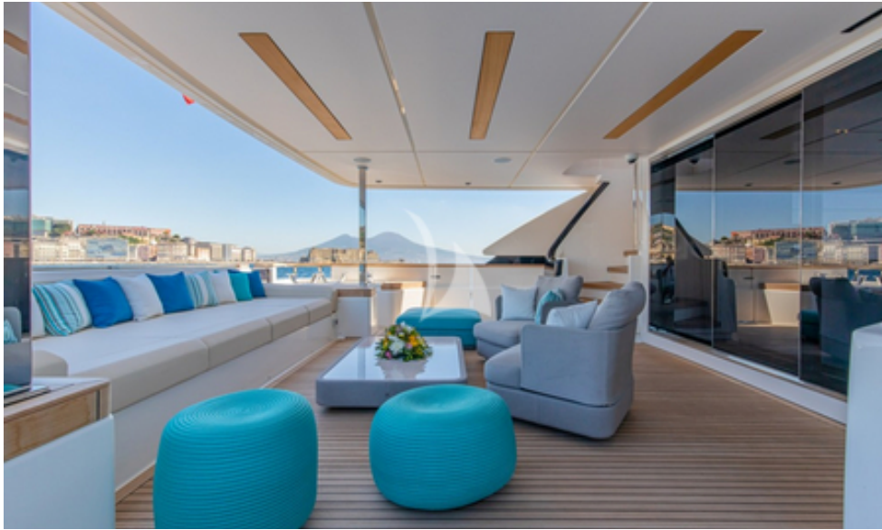
The aft deck seatings