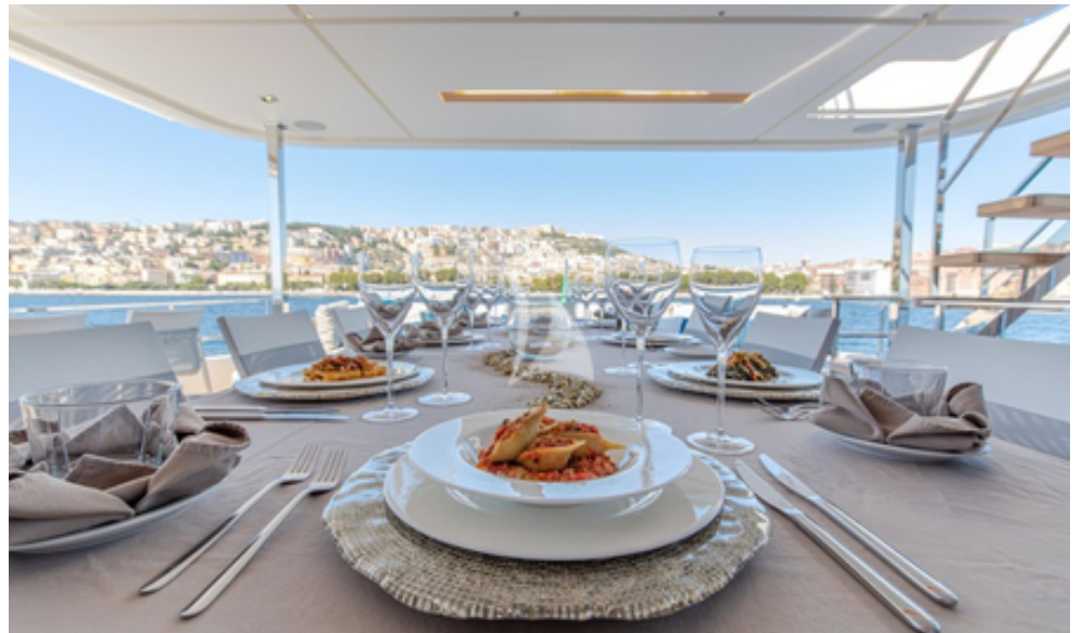
The Chef's specialties