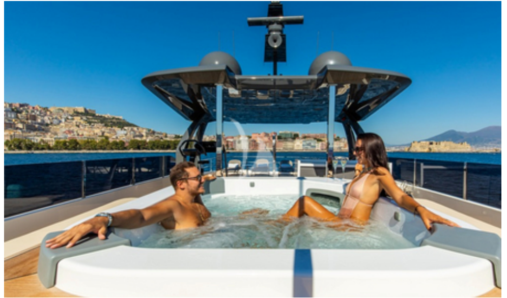
The brand new Jacuzzi